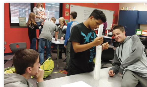
Eighth-graders take the paper tower challenge.

the tower. If their first plan didn't work, they shifted to the problem solving process to resolve any issues their towers were having. The activity was fun and applicable to real-life work situations. The eighth graders are scheduled to visit the Sidney High School Workforce Academy and RCI/ Workforce Partner Lab classrooms in January. The mission is for them to see the state-of-art classrooms and to hear first-hand from high school peers about their learning experience, which will give them a better understanding of the opportunities available to them next year.