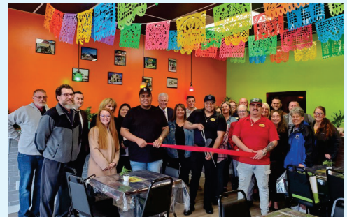
Ribbon Cutting at Victors Taco Shop on Vandemark Road