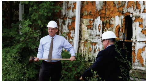
Senator Huffman & Commissioner Guillozet take a swing at the Wagner Building wall

The Shelby County Land Reutilization Corporation (Land Bank) was awarded $2,815,000 for the cleanup and remediation of the site through the Ohio Brownfield Remediation Program. In addition, the city received a $1.0 million earmark in the 2021-2022 State of Ohio Capital Budget bill and has budgeted an additional $500,000 toward the site remediation. The Shelby County Commissioners have committed another $250,000 toward the project.