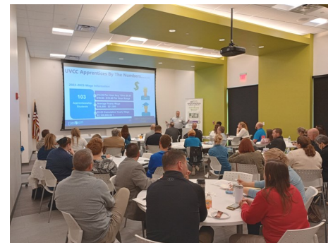
Community Leaders gathered in 2024 to update the community's economic & community development strategy.