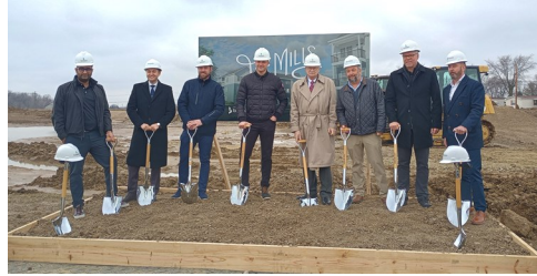
The Mills broke ground early in 2024 in Sidney. At completion, this project will offer 216 new apartments with a variety of amenities.