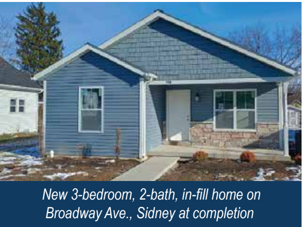
New 3-bedroom, 2-bath, in-fill home on Broadway Ave., Sidney at completion