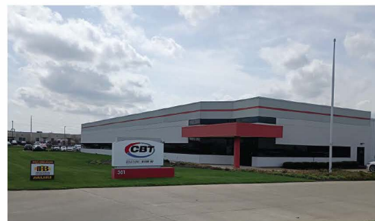
Pictured: The CBT location on Ross St. in Sidney will become the expansion site for Sollman Electric.

Sollmann Electric, a local electrical contractor with a 53-year legacy in Sidney plans to expand to the CBT building at 2450 Ross St. The project involves the relocation of 48 employees and other assets from their current office at 310 East Russell Rd. Once completed, the company will also create 10 new full-time employee positions.