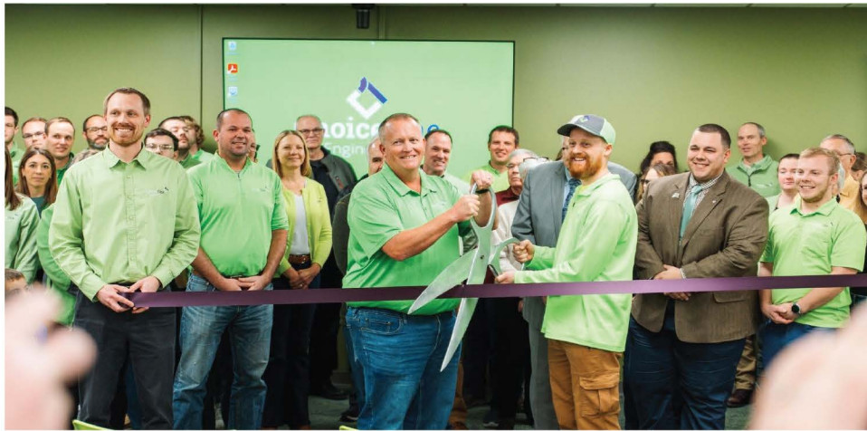
Pictured: Choice One Engineering staff at the ribbon cutting for its new location at 2633 Campbell Rd. in Sidney.

The firm plans to renovate the remaining 11,000 square feet of the building in future phases, further supporting local investment and long-term growth. Along with the firm's Loveland, Ohio office, Choice One's 86 total employees are proud to acknowledge Sidney as the founding point of the firm and looks forward to many more years of partnership with the communities and clients that have shaped its success.