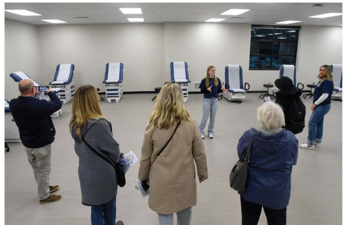
Pictured: The new UVCC medical lab.