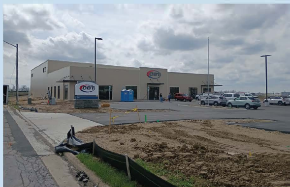
Pictured: The new CBT building at its new location on Norcold Dr. in Sidney.

CBT is near completion on a new 24,375 s.f. training & distribution center on Norcold Dr. in Sidney. The project will retain 30 jobs and invest approximately $4.8 million. This expansion includes the relocation of the company's operation from Stolle Dr. to Norcold Dr. sometime in 2026.