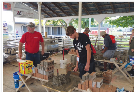
Ferguson Construction's booth featured hands-on experience with brick-laying.