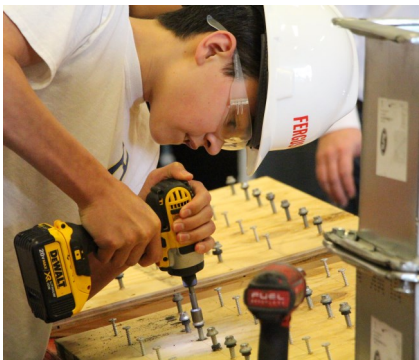
Students competed to complete the Skilled Trades Ninja course with the fastest time.