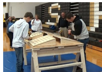
Ninja Skilled Trades Challenge with Slagle Mechanical, Area Electric, and Ferguson Construction