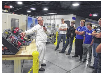
Manufacturing Month with Honda and Detailed Machining