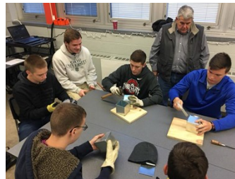
Skilled Trades Month with Slagle Mechanical and Upper Valley CC