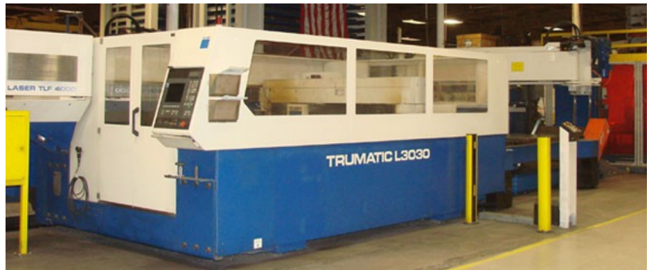
TLF 4000 Lasers with Autoload System

Everyday Technologies is NQA ISO 9001 and ISO 14001 registered and employs nearly 100 at its Sidney and Wapakoneta locations.