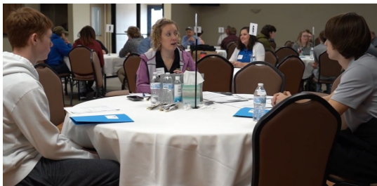
Companies interview students