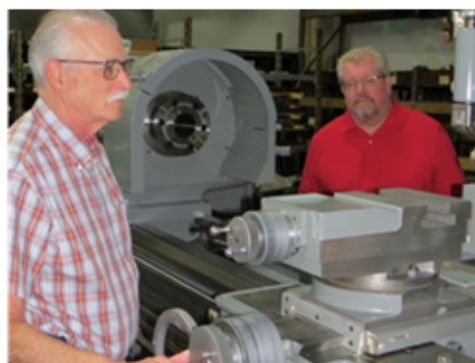
The Monarch EE Precision Tool Room Lathe continues as the world standard of fine, repeatable precision.