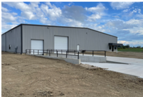
The 12,000 s.f. Spec Building is located in the Russia Industrial Park