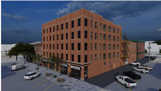
Rendering of renovated Ohio Building

The transformation of the Ohio Building into a vibrant mixed-use space marks a significant milestone in the City of Sidney's effort to preserve this historic structure. Formerly a 60,000 square foot mixed-use office building, the Ohio Building, spearheaded by Woodard Development, is currently undergoing an $11,000,000 transition into 50 modern apartments and two ground-floor commercial spaces. This project not only contributes to the urgent demand for