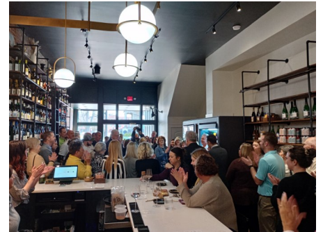
Grand Opening of Austeria Wine Boutique

The most recent grand opening in downtown Sidney is the Austeria Wine Boutique, which offers wine, beer, craft cocktails and a food menu including charcuterie boards, cheese, salads, sandwiches, olives, nuts and other lighter fare that pairs with their wines. They are located in downtown Sidney at 109 S. Ohio Avenue with hours Tuesday-Thursday 11 am to 8 pm, Friday – Saturday 11 am to 9 pm and Sunday 11 am – 8 pm. Learn more at austeriawine.com .